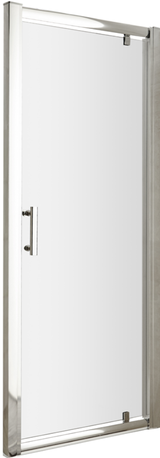
Pacific Pivot Door Enclosure

DESCRIPTION: Pacific 760 Pivot Door (Adj 700X760)